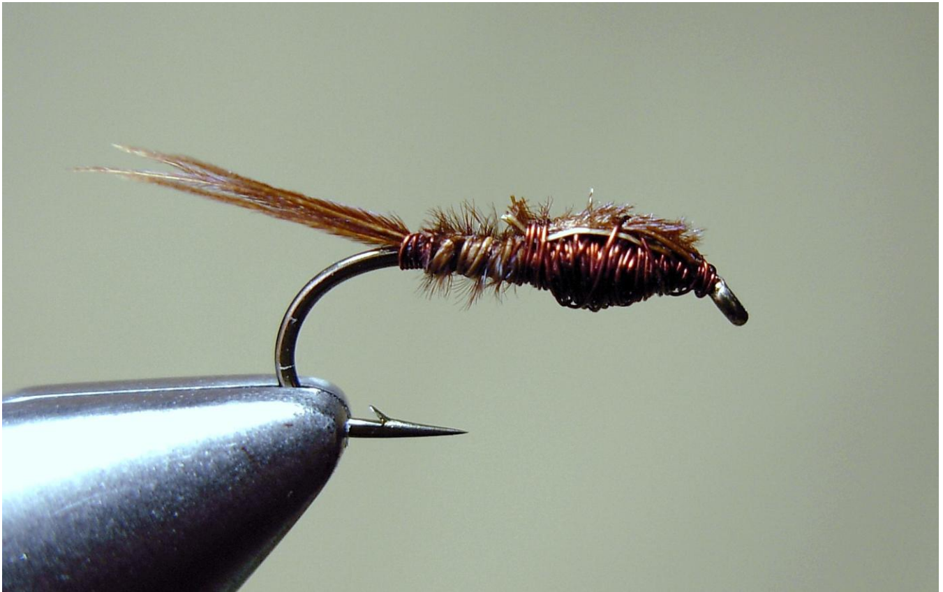
Pheasant Tail Nymph or PT Nymph.