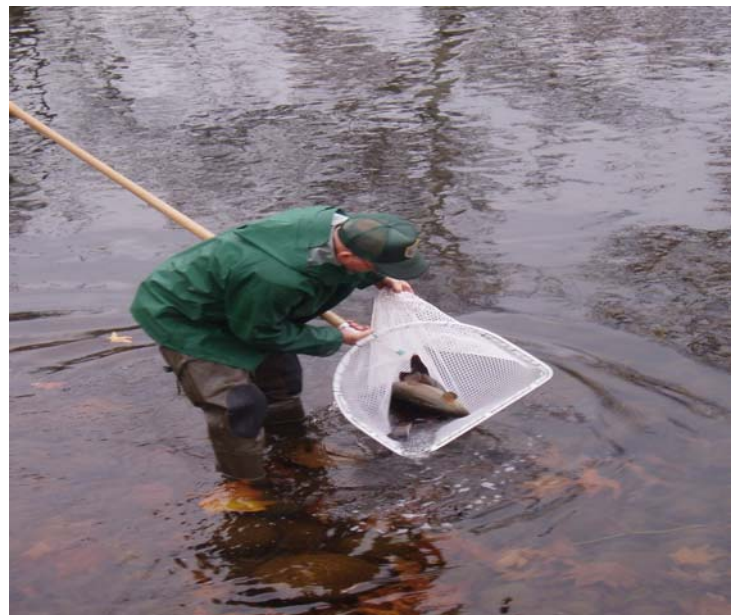
DFG stocking the Lower Kern