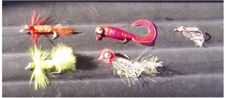
Four Shad Flies & a Pink Curly Tail Jig

I don't consider myself a "Shad Guy" or a "Bass Guy" either. I'd much rather stick to the cold water fish. But there's something about these Shad that just get under your skin. After the demise of my favorite trout water, I sort of wanted to puke when someone mentioned "Squaws Leap". We moved away from Fresno for a few years & it was in the early 1990's when I thought about giving the Shad a try again. My two sons were in grade school. We rigged up some spinning gear with cast-a-bubbles and a pink curly tail jig and set out for the "Leap" (it's called San Joaquin River Gorge now). We caught countless feisty 15"-20" Shad that day & have been going ever since. It's with fly rods now but I must confess the pink curly tail crappie jigs still out-fish the flies we tie.