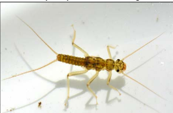
3: Stonefly, Bay Horse Flat, Kings River