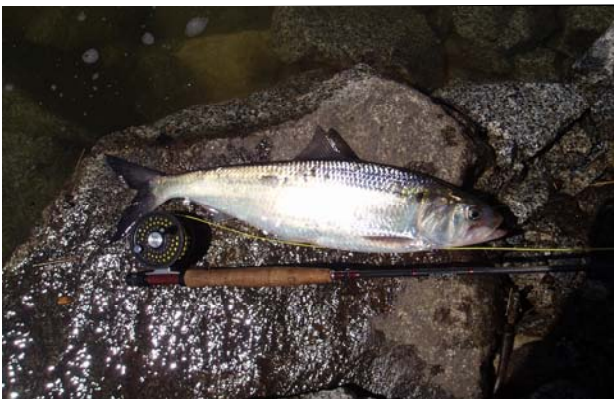
22" American Shad from the San Joaquin River