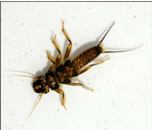
2: Stonefly, Bay Horse Flat, Kings River