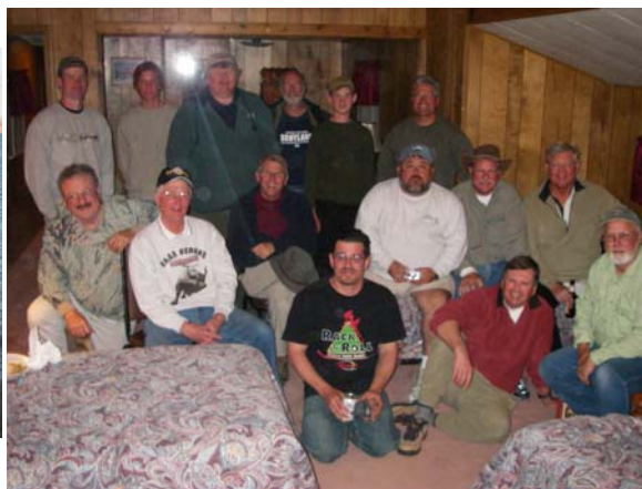
Pyramid Lake Trailer Trash