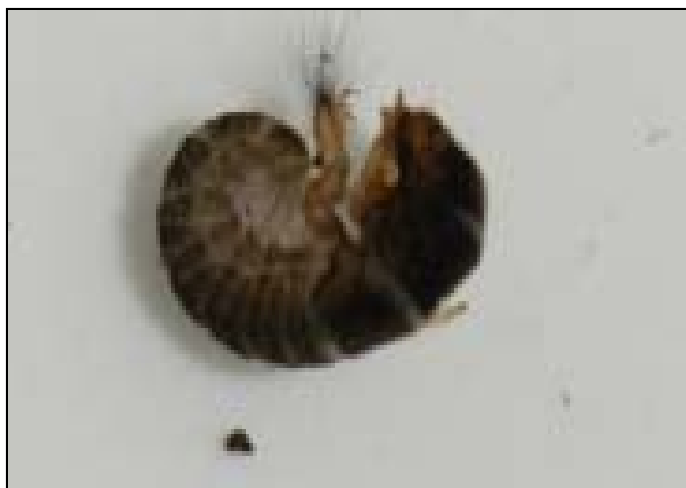
10: Caddis, Bay Horse Flat, Kings River