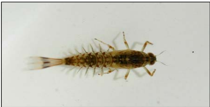
6: Mayfly, Bay Horse Flat, Kings River