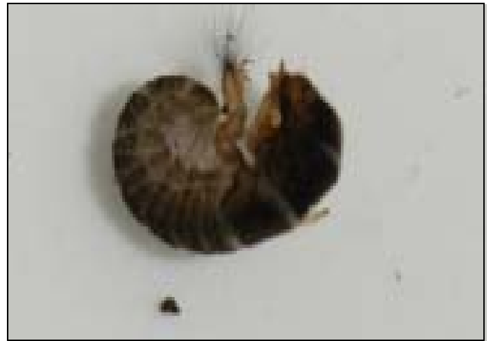
10: Caddis, Bay Horse Flat, Kings River