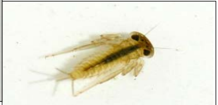
9: Mayfly, Bay Horse Flat, Kings River