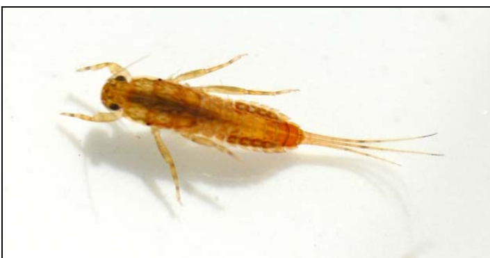
7: Mayfly, Bay Horse Flat, Kings River