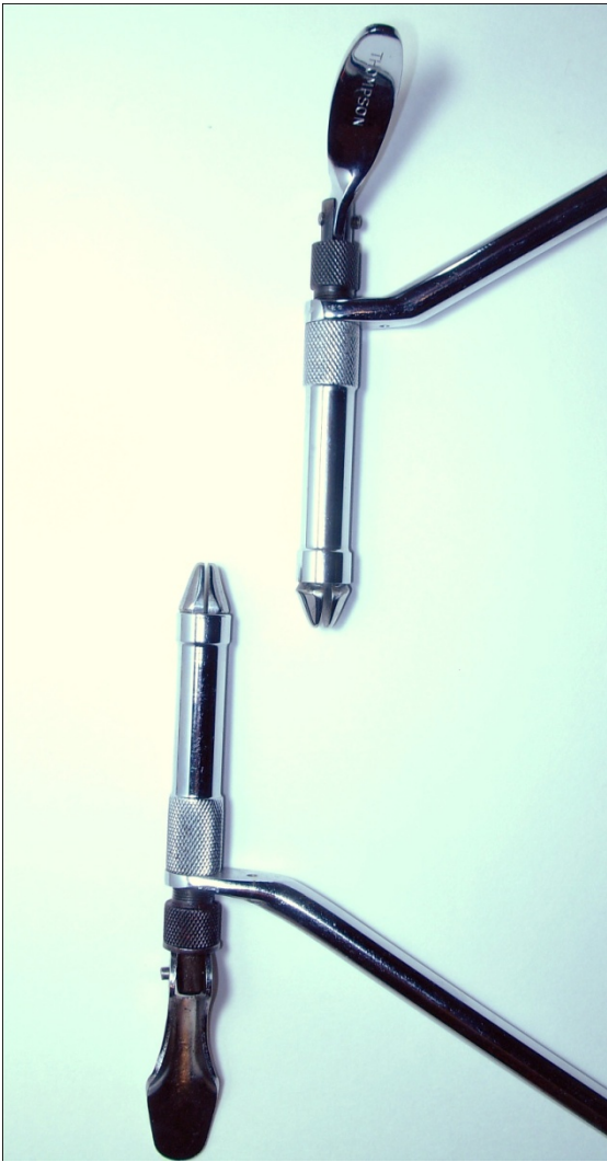
These are the older Thompsons, the good ones.